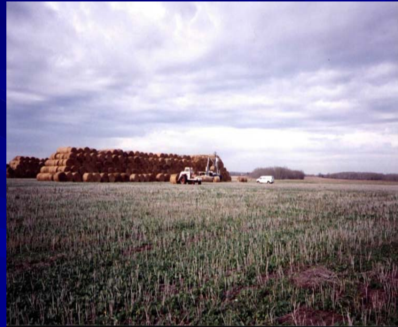
Building new flax piles