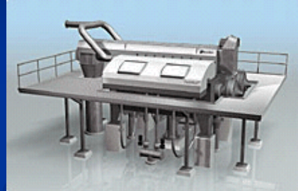
Metso TwinRoll Press Washer