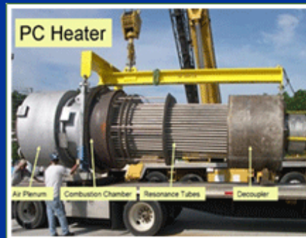
TRI Pulse Combustor